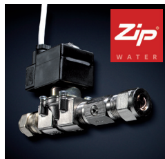
Latching valve with plumbing connections and Zip Restrictaflow water flow restrictor.