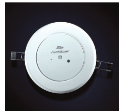
Ceiling sensor. 128mm diameter x 105mm cutout.